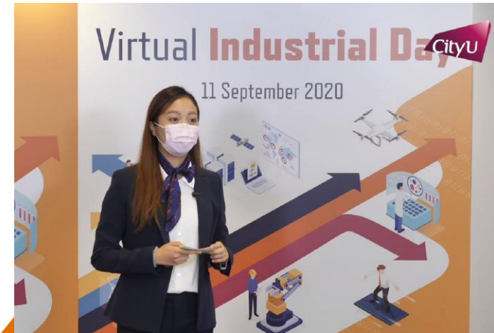
CENG Student Ambassadors serving as MC in Virtual Industrial Day

This CENG Ambassadors Scheme provided students a platform to acquire the soft skills in order to develop College-based exemplars of CityU all-rounded students, serve numerous University & College activities, as well as to improve the image of CityU students