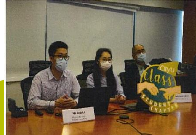
1 st Workshop on: “Stress no more when applying for internships”

The presentations helped the students gain better understanding of various management cultures in different organisations and the etiquettes for a successful internship. Stimulation to students’ career development and linkages with industries /employers.