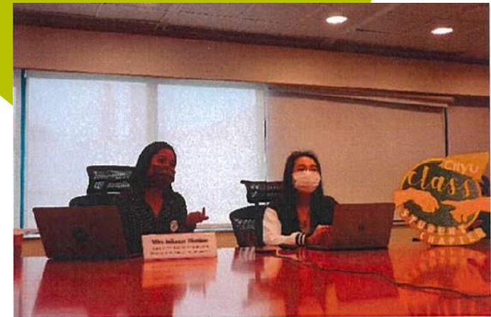
2 nd Workshop on “Expectations and etiquettes for internship”