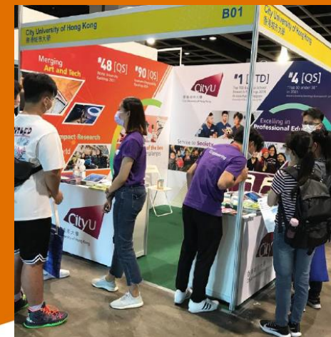
Representing CityU at the Hong Kong International Education Expo 2021